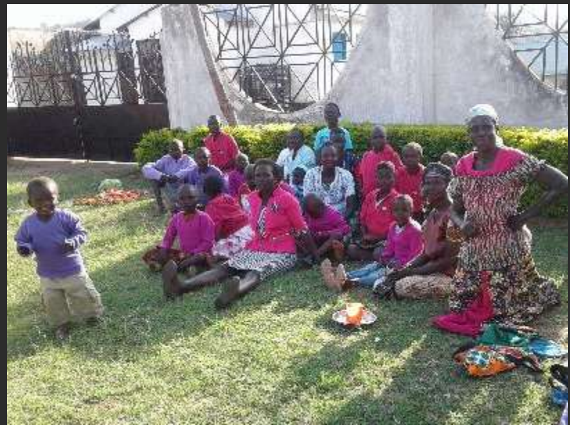
PARTY FOR HOME SUPPORT FAMILIES