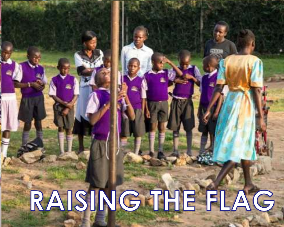
RAISING THE FLAG